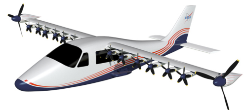
NASA X-57 Maxwell © NASA, DEP configuration

The internship is related to the test of a recently developed formulation for the unsteady aerodynamics analysis from an exergy point of view. Exergy analysis has proven to be an appropriate tool to evaluate the aerodynamics of innovative aircraft configurations in which the propulsion system is highly integrated.